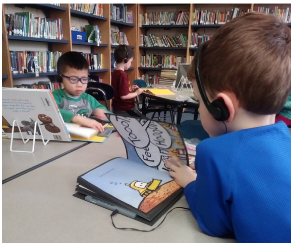
VOX Books that Talk