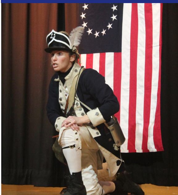
History at Play