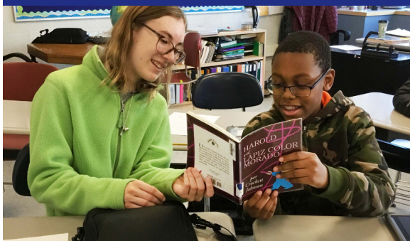
Hispanic Literacy Expansion