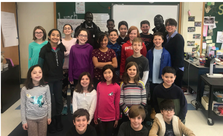
Top: Studying Greek coins using iPad stands at High Rock. Bottom: Developing global awareness and citizenship at Newman.

The NEF raises funds and awards grants to promote innovation and excellence in education for Needham public school students. By funding leading-edge programs that are outside of normal and expected public funding, the NEF enhances the curriculum and provides an important means for teachers, parents and students to learn, experiment and explore.